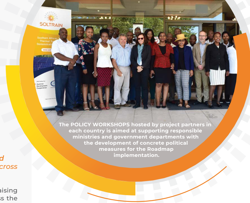
The POLICY WORKSHOPS hosted by project partners in each country is aimed at supporting responsible ministries and government departments with the development of concrete political measures for the Roadmap implementation.